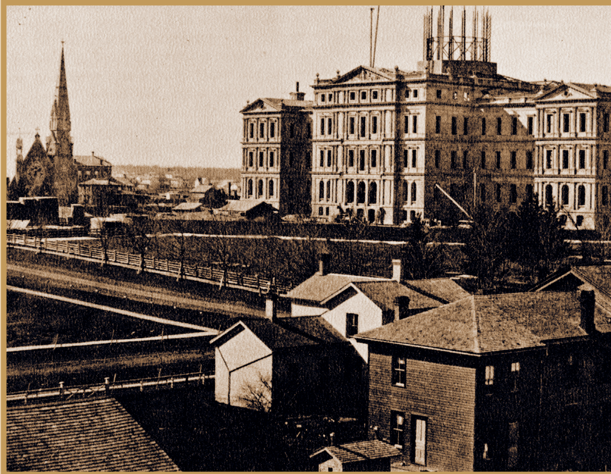
New Capitol with dome beginning to rise and Plymouth Congregational Church to the south, spring 1877.