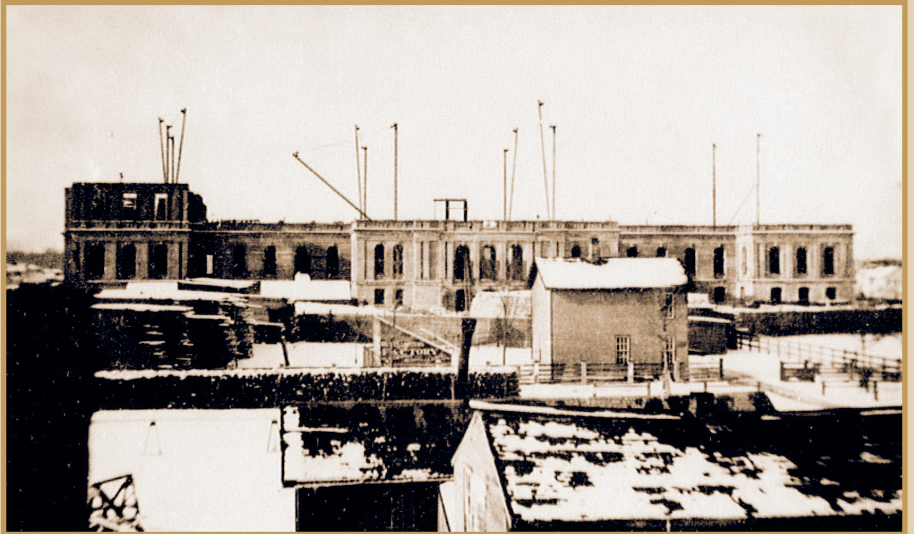
Winter view of the New Capitol, December 1874.