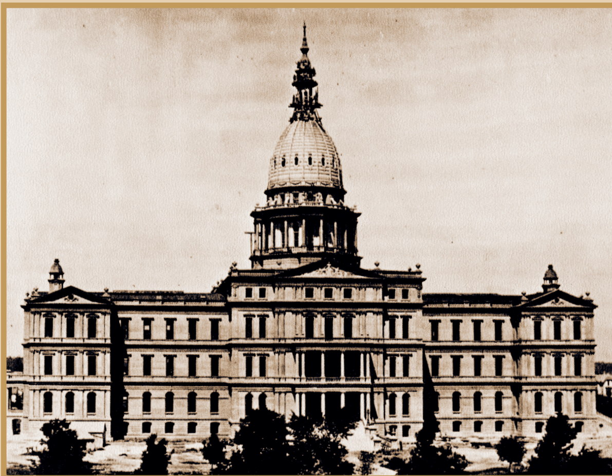
Nearly completed Capitol with men on lantern at top of dome, June 29, 1878.