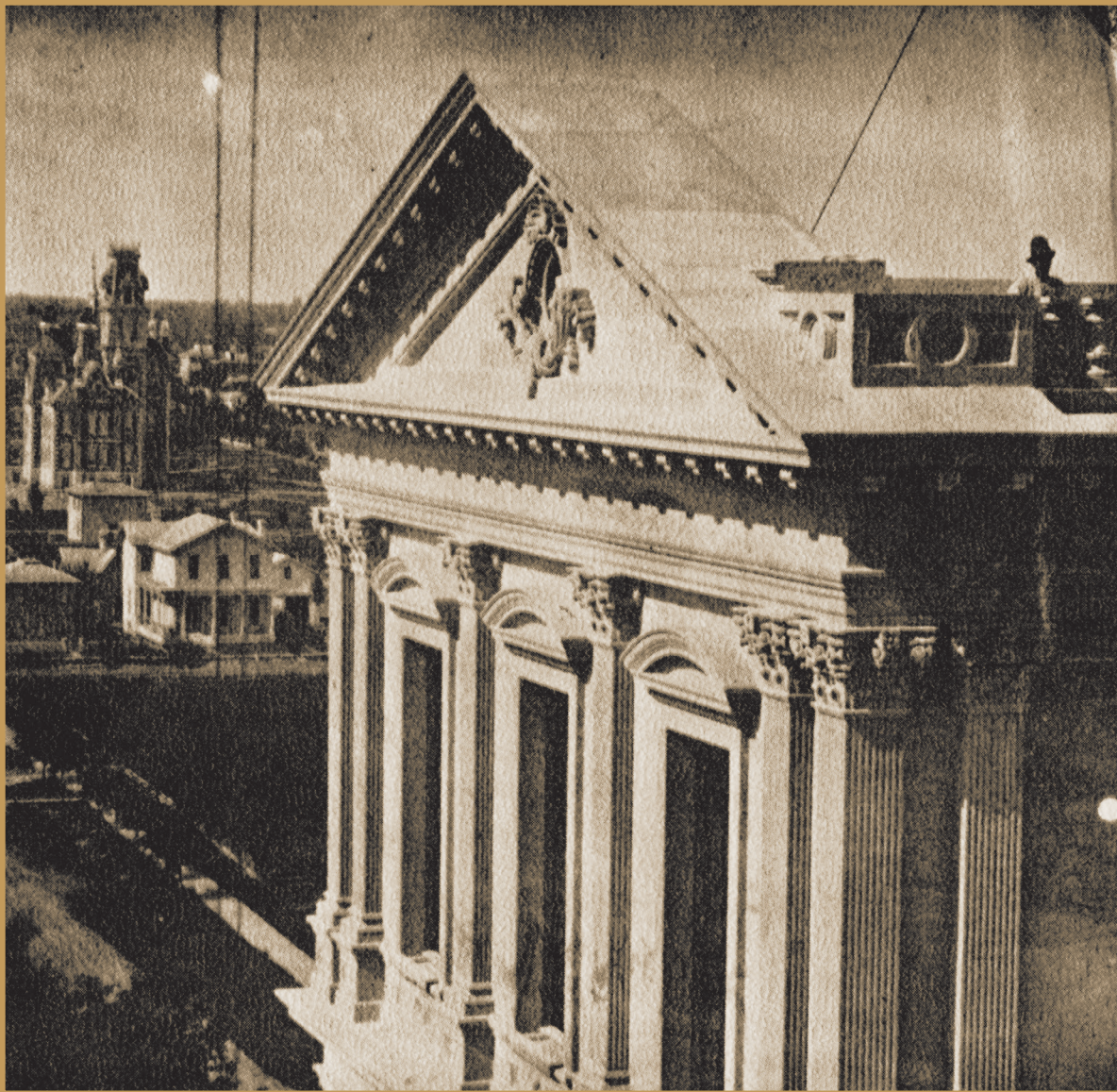
The west side of the Capitol looking north with old Lansing High School in background.