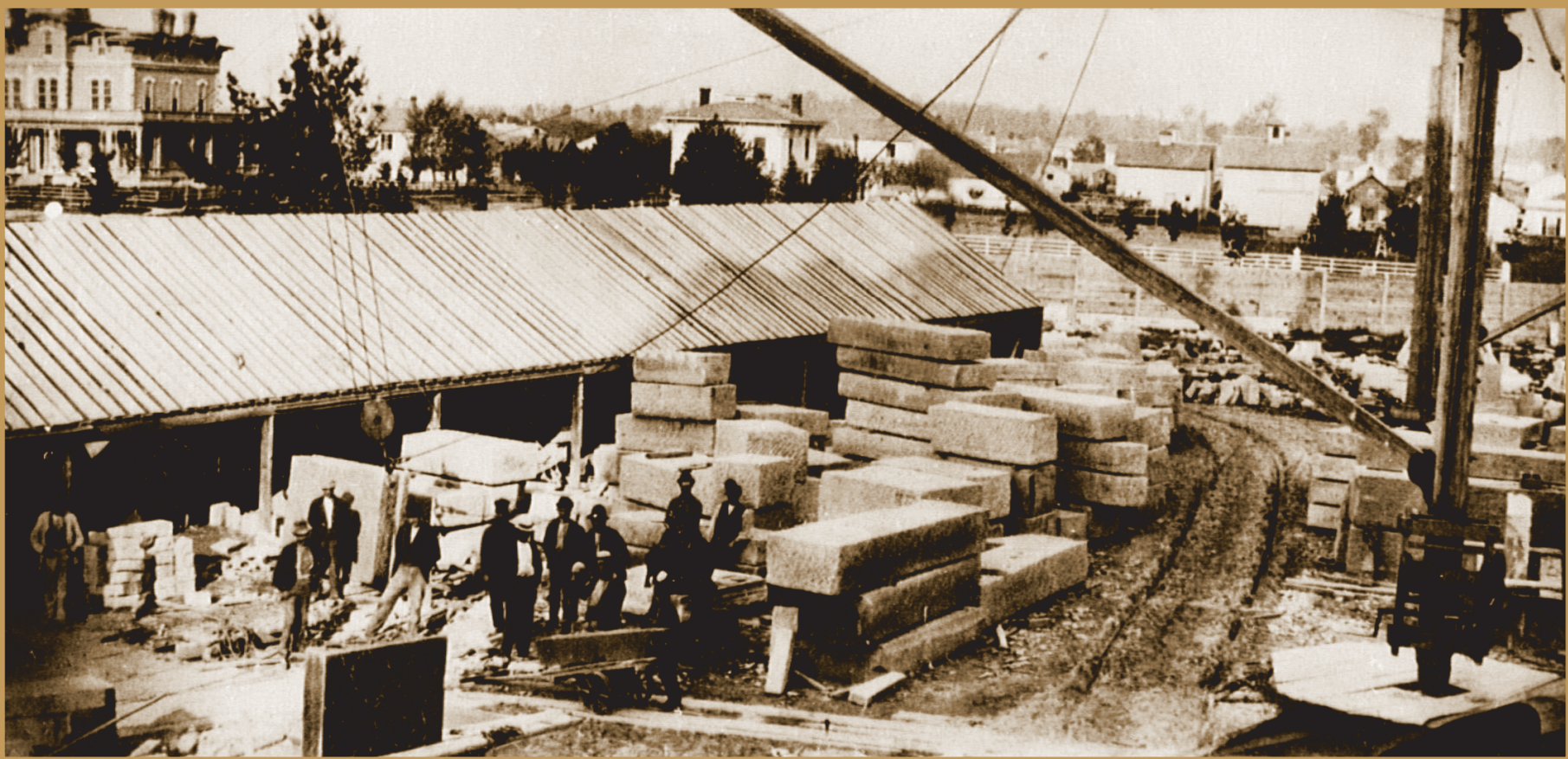
Stoneyard of the New Capitol.