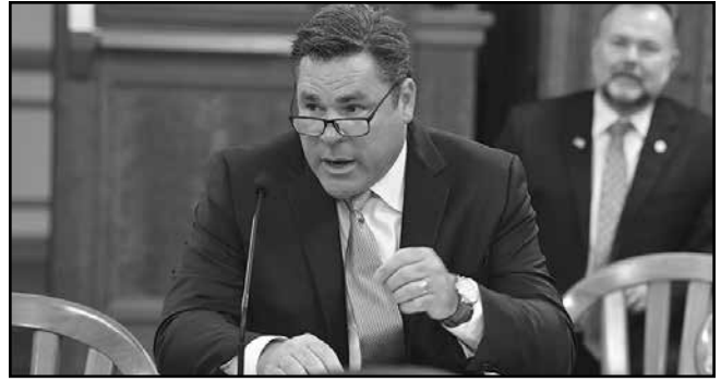
Legislator addressing the members of a committee during a hearing.

7. Keep your testimony short and to the point. If your testimony is lengthy and complex, it is best to offer highlights at the hearing and request permission to place your complete position and supporting material in the record. Anything you present in writing will be placed in the committee members' files and will be available to them at any future meetings. If possible, have copies of testimony available for committee members and staff.