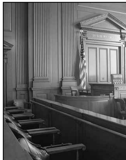
Court decisions as handed down in this county courthouse sometimes bring about the need to make changes in the law.

shape. In many cases, a combination of these sources and conditions play an important role in the transformation of ideas into bills. Even though the goals, interests, and priorities of the people are in constant change, these early stages of the legislative process continue to determine how an idea becomes a bill.