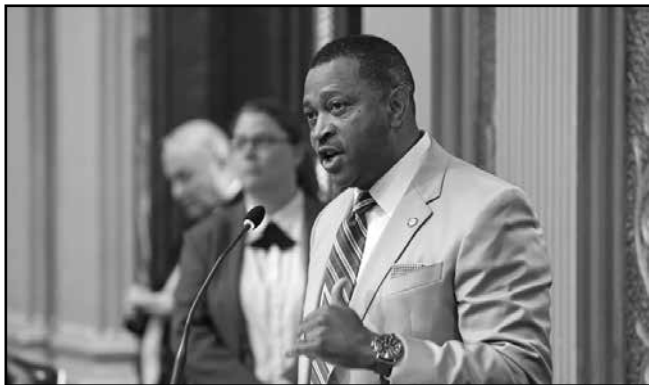
Legislator addresses colleagues on session floor.

The principal responsibility of a state legislator is the business of lawmaking. The business of lawmaking is a demanding one, in that legislators must perform a wide array of duties which require a diversity of skills and abilities. In addition to sponsoring and introducing bills, which require administrative, managerial, and political skills, a legislator must attend sessions and committee meetings and study the many bills introduced by other lawmakers, which requires analytical skills.