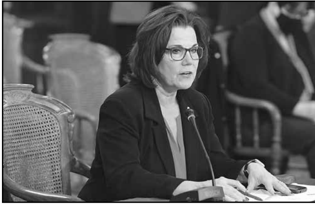
Testimony is vital to the process of gathering information.