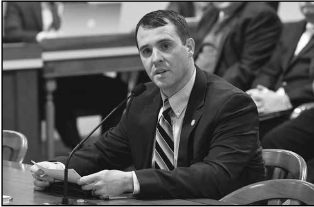
Legislator addresses colleagues during a committee meeting.

items appropriating money in any appropriation bill. The part or parts approved become law, and the item or items disapproved are void unless the Legislature repasses the bill or disapproved item(s) by a two-thirds vote of the members elected to and serving in each chamber. An appropriation line item vetoed by the Governor and not subsequently overridden by the Legislature shall not be funded unless another appropriation for that line item is approved.