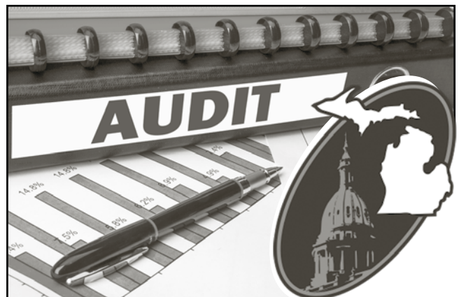
The Office of Auditor General (OAG) examines agency financial records and reviews program operations.

The Legislature also exercises its oversight authority through the appropriations process. In addition to using budget amounts to reflect the Legislature's wishes, appropriations bills often include various reporting mechanisms to monitor how state and federal funds are being spent. The budget document has built into it so-called "boilerplate" provisions that accommodate the oversight of past appropriations. For example, a boilerplate provision may require a department to report to the Legislature or a specific committee.