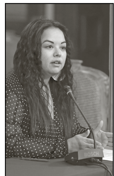
Legislator attends a committee meeting.

The major focus of a standing committee is prospective in nature because the committee is considering bills to correct existing problems and solve future needs. However, there may also be a retrospective focus in that a standing committee may evaluate how well state agencies are carrying out legislative intent.