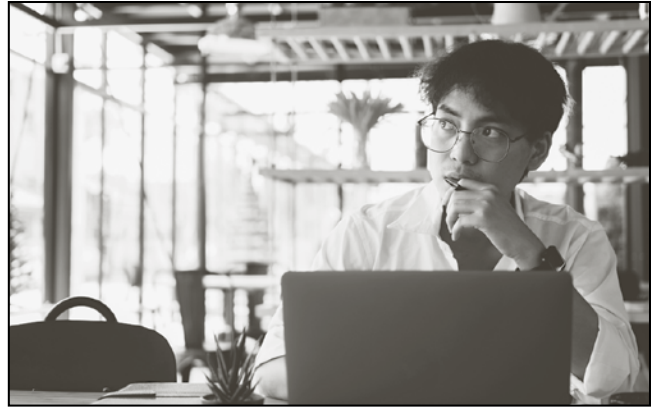
A well-written letter or e-mail is usually the best way to communicate concerns and ideas to a legislator.