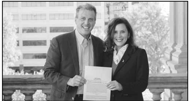
Legislator joins the Governor for a bill signing ceremony.

Restricted revenues are those resources which, by Constitution, statute, contract, or agreement, are reserved to specific purposes. Expenditures of restricted revenues are limited by the amount of revenue realized and amount appropriated. In addition to the General Fund, special revenue funds are used to finance particular activities from the receipts of specific taxes or other revenue. Such funds are created by Constitution or a statute to provide certain activities with definite and continuing revenues. Other types of funds include revolving funds, bond funds, bond and interest redemption funds, and trust and agency funds.