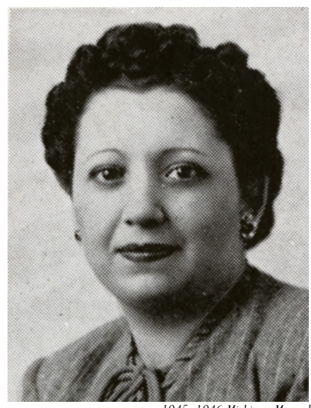
1945–1946 Michigan Manual