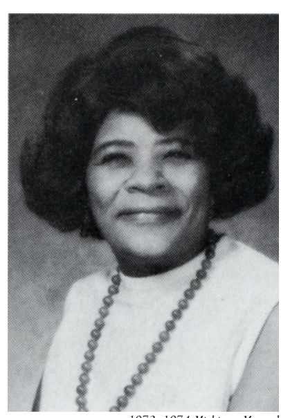
1973–1974 Michigan Manua

Education: Detroit Institute of Commerce