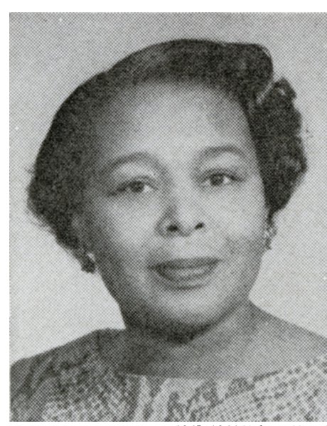
1965–1966 Michigan Manual

Education: Detroit Institute of Technology