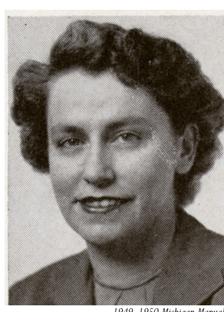
1949–1950 Michigan Manua

First woman elected Lieutenant Governor of Michigan