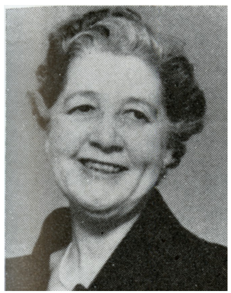
1963–1964 Michigan Manual

Died: January 24, 1976, Boynton Beach, Fla.